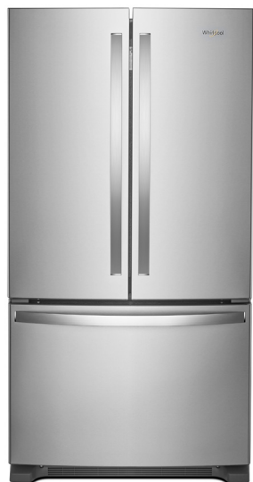
Shown in Fingerprint-Resistant Stainless WRF535SMHZ